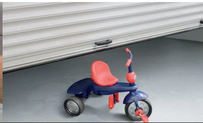
Safety and anti-fall devices

NEW! Control unit configurable in 5 different variations