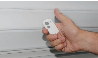
Unlocking by remote control