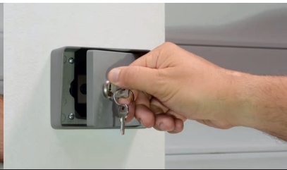
Unlocking by key switch