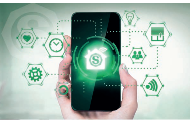
Controlled by the Stafer Home APP

MANUAL OPENING OF THE GARAGE DOOR THANKS TO THE BACKUP BATTERY AND THE COMBINED ASSIST SPRING